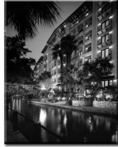
La Mansion del Rio