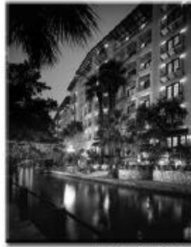
La Mansion del Rio